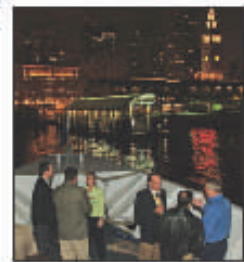
LPRT qualifiers enjoy a cruise of San Francisco Bay at NAHU's 2006 Annual Convention.

Another great recognition for LPRT qualifiers is the LPRT event at the NAHU Annual Convention. Each year LPRT hosts an event to honor all LPRT qualifiers attending the convention. These events have ranged from exclusive breakfasts and luncheons with guest speakers to fabulous dinner cruises.